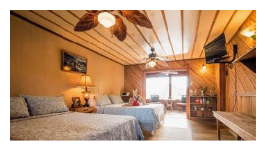
Utila Lodge standard double room. Image used with permission.

from connecting hubs in the United States. From San Pedro Sula you will travel on to Utila by a short charter flight or flights also arranged by Atlas. Once you have applied, we will give you the contact information for Atlas Travel to initiate your arrangements.