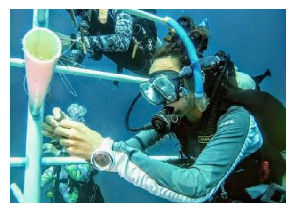
Coral restoration at WSORC.

Leadership training is also a component of our program. Everything we do requires young people to take responsibility for themselves and others in the group and allows opportunity for students to take frequent leadership roles. Students also receive direct leadership skills training and support in bringing the learning home to address pressing issues facing the seas, no matter where they live, in projects around rivers, lakes, and even landlocked ecosystems!